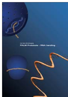
LCM Protocols RNA handling