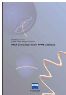
Short Protocol RNA extraction from FFPE sections